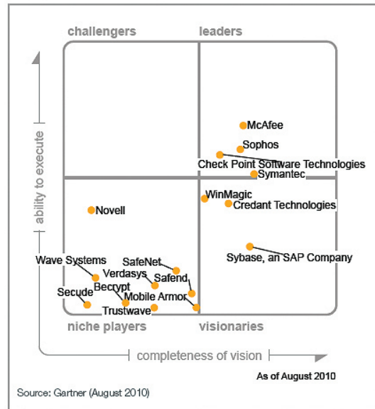
Figure 3. Gartner Magic Quadrant for Mobile Data Protection.

Leading analyst firm Gartner evaluated data protection solutions based on completeness of vision and ability to execute in their Gartner Magic Quadrant for Mobile Data Protection 2010 . 2 McAfee is positioned in the leaders quadrant.